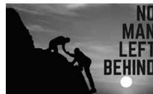
6TH ANNUAL CATHOLIC MEN'S CONFERENCE