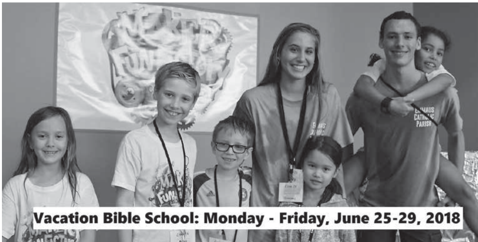
Vacation Bible School: Monday - Friday, June 25-29, 2018

Mobile Loaves & Fishes Service Camp will be Tuesday - Friday, July 10-13 and Vacation Bible School will be the week of June 25-29. Registration will begin sometime in March. Please check the Emmaus website for details as we get closer to the summer.