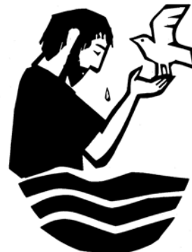
WELCOMING OUR NEWLY BAPTIZED Christopher Cullen Liles

FEMA Representatives are prepared to explain the availability of FEMA ASSISTANCE PROGRAMS . They will also offer to complete the registration on-site when they meet the resident, but residents can also apply immediately online or by phone. Eligible residents can apply online immediately at DisasterAssistance.gov (Spanish: disasterassistance.gov/es ) or by phone at (800) 621-3362 or (TTY) (800) 462-7585. Applicants who use 711 or Video Relay Service may call (800) 621-3362. Multilingual operators are available. The toll-free numbers are open 7 AM-10 PM seven days a week. Eligible residents should register even if they have insurance.